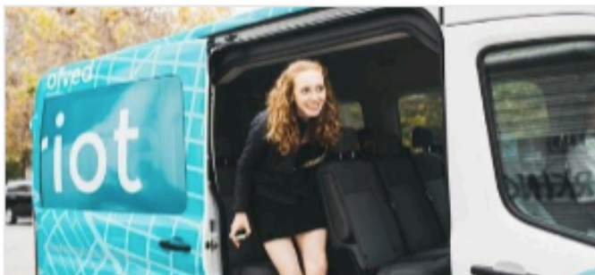
Chariot Introduction Video

----- Seed Round lead investor: SoftTech VC. Acquired by Ford (NYSE: F) in September 2016.